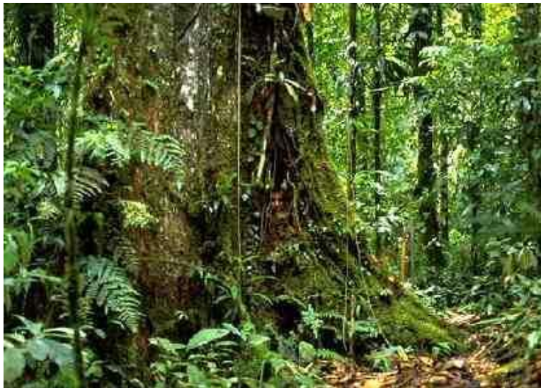
Fig. 2 The Amazon rainforest.

Therein the dichotomy: In arid regions, there are plenty of nutrients, but not enough water; in humid regions, there is plenty of water, but not enough nutrients. At the extremes of the climatic spectrum, regions where mean annual precipitation is less than 100 mm are referred to as superarid; regions with mean annual precipitation greater than 6400 mm are referred to as superhumid (Ponce et al. 2000). In superarid regions, life is hard because there is very little water. In superhumid regions, life is hard, particularly for humans, because most of the nutrients have been leached out of the soil.