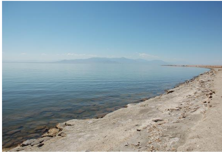
Fig. 5 The Salton Sea.

How to cope with the natural distribution of water and nutrients across the climatic spectrum? By all accounts, the import of water into arid regions solves the problem of water supply, but this is necessarily at the cost of creating a problem of salt disposal. In effect, the two major salts, calcium and sodium, are produced from soils in greater quantities than needed by the artificial ecosystems, and thus end up polluting neighboring watercourses in the case of open drainage systems, or inland lakes in the case of closed drainage systems. For instance, the salinity of the Salton Sea, in California, a closed system which has been receiving agricultural drainage for the past 100 years continues to increase, with no end in sight (Ponce 2009) (Fig. 5).