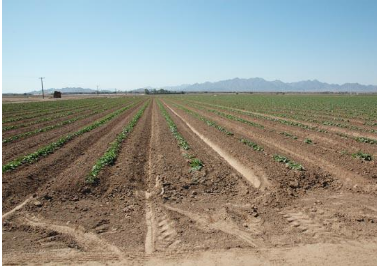
Fig. 3 Irrigated field, Wellton, Arizona.

Over the past century, humans have endeavored to challenge Nature's design by irrigating arid lands, that is, moving water great distances to irrigate the deserts, thereby making them productive (Fig. 3). Since deserts have a store of nutrients, all that is required to start using those nutrients is to add imported water to the soil.