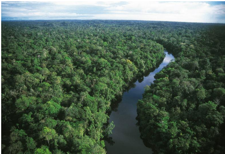
Fig. 4 The Amazon rainforest.

Superhumid regions, though, remain largely unexploited by humans, because most people are uncomfortable in the high humidity that prevails in these regions (Fig. 4).