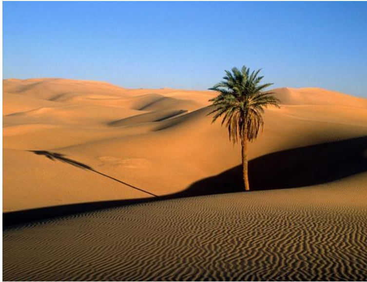
Fig. 1 The Sahara Desert.

Therein the dichotomy: In arid regions, there are plenty of nutrients, but not enough water; in humid regions, there is plenty of water, but not enough nutrients. At the extremes of the climatic spectrum, regions where mean annual precipitation is less than 100 mm are referred to as superarid; regions with mean annual precipitation greater than 6400 mm are referred to as superhumid (Ponce et al. 2000). In superarid regions, life is hard because there is very little water. In superhumid regions, life is hard, particularly for humans, because most of the nutrients have been leached out of the soil.